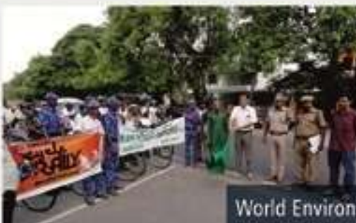
World Environment Day Cycle Rally at DSC T