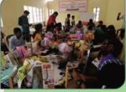
VHC Art Crafts at DSC T