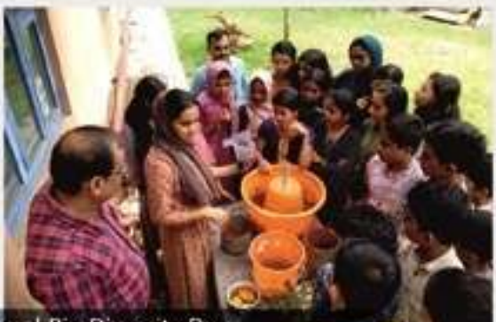
International Bio Diversity Day Vermicompost Demonstration at RSC & P C