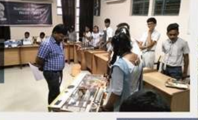
National Science Week Science Model Making Contest at RSC T