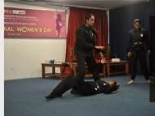
Live demonstration of defence techniques for women during International Womens Day at VITM