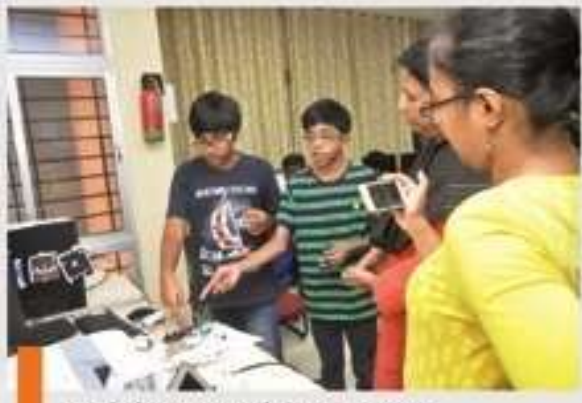
Workshop on Arduino at VITM