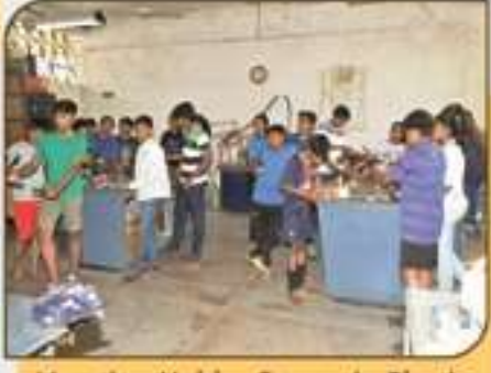
Vacation Hobby Course in Physics at VITM