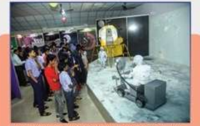
Exhibition on Touch down Moon at RSC & P C