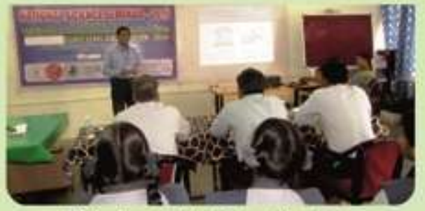
Puducherry State Science Seminar