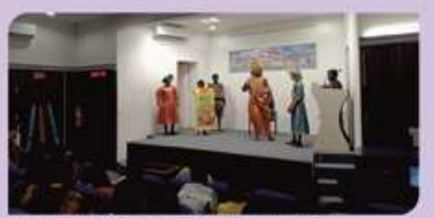
District Science Drama Contest at DSC T