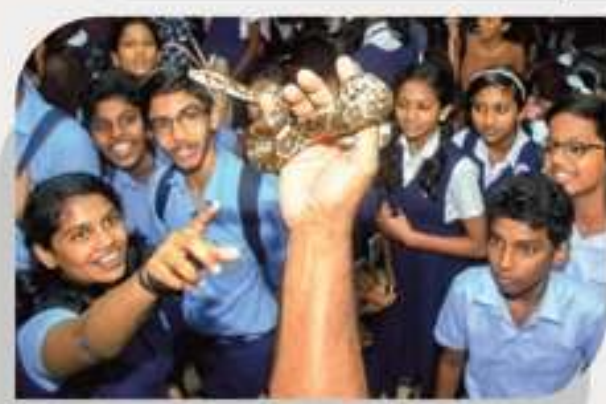
'A day with snake' programme at RSC & P C