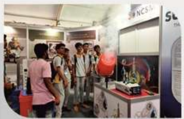
NCSM Pavilion during 107th Indian Science Congress at GKVK campus Bengaluru