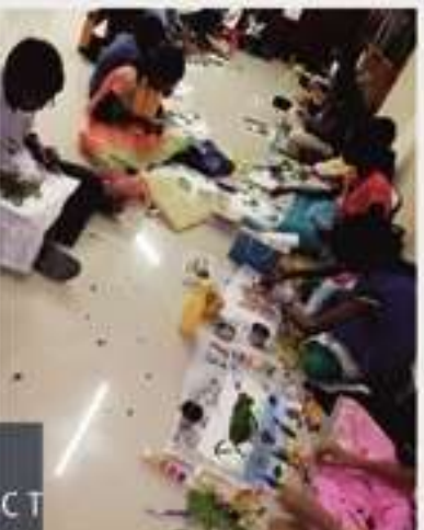
World Earth Day Leaf Zoo Contest at DSC T