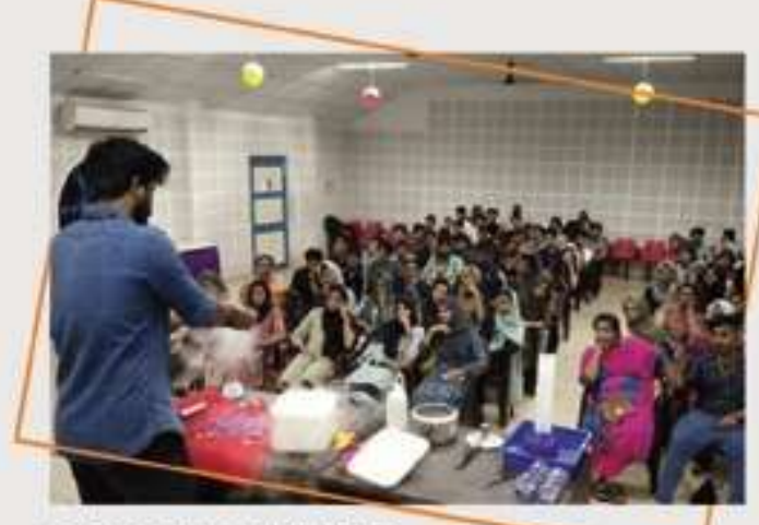
Science show at RSC & P C