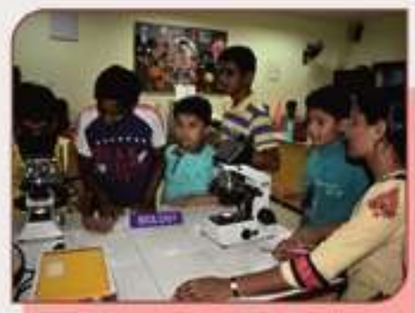
CAC Electronics at DSC G