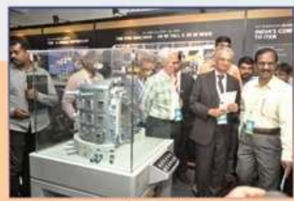
Vigyan Samagam - Inauguration Programme at VITM