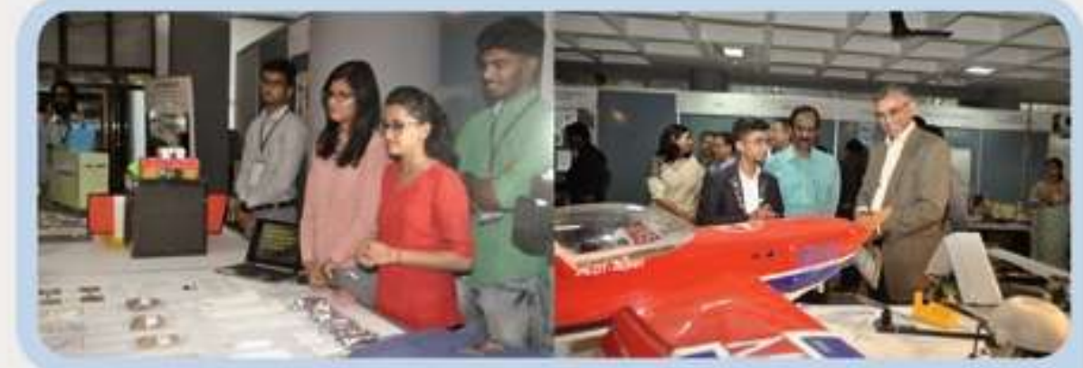
Innovation Festival at VITM