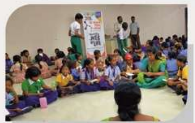
Science Film Festival activity at RSC T