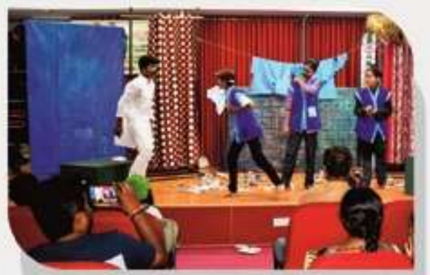
District level Science Drama Contest at DSC G