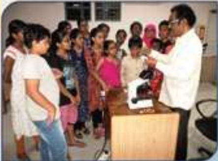
Summer Camp Bioscience at RSC T