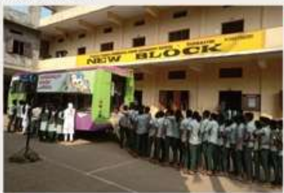
RSC & P C MSE programme in Aspirational Districts of Kerala