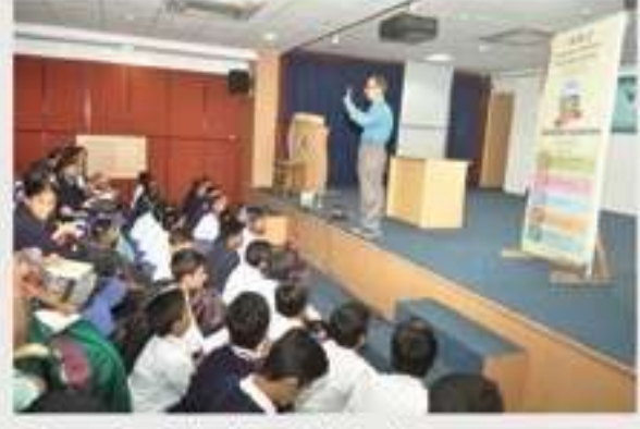
Science Quiz during 54th Anniversary of VITM