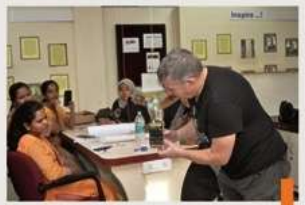
Teachers Training Programme at VITM