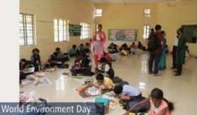
Drawing Contest at DSC T