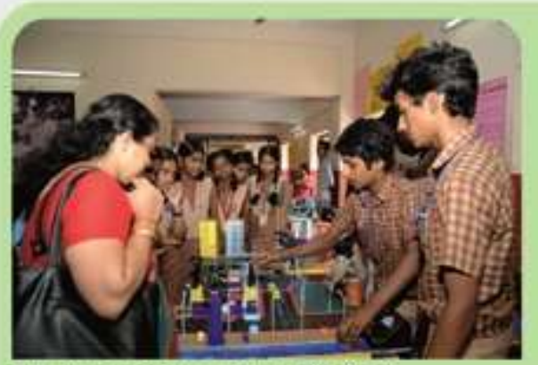
Sub District Science fair at RSC & P C