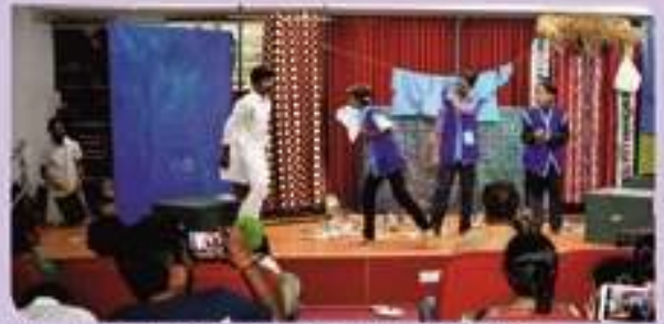
District Science Drama Contest at DSC G