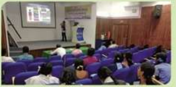
District Level Science Seminar at DSC T