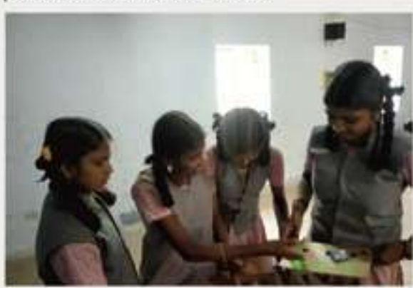
DSC T Model making workshop during MSE