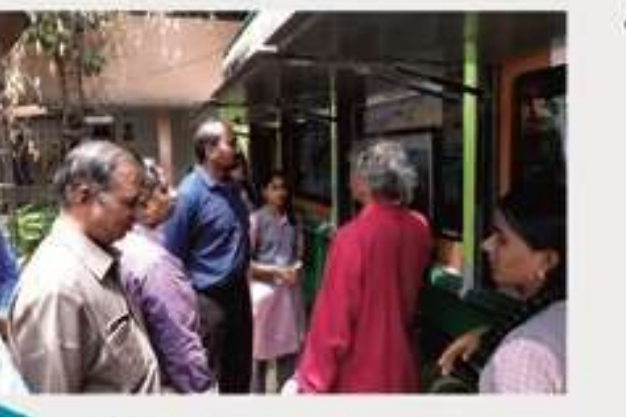
DSC T MSE programme in Aspirational Districts of Tamilnadu