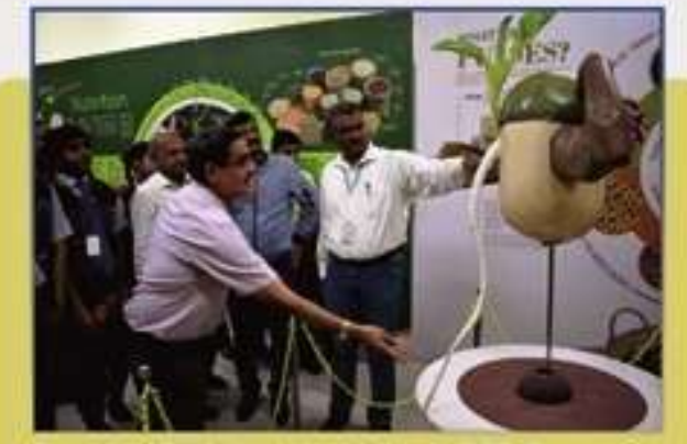
Traveling Exhibiton on pulses at DSC G