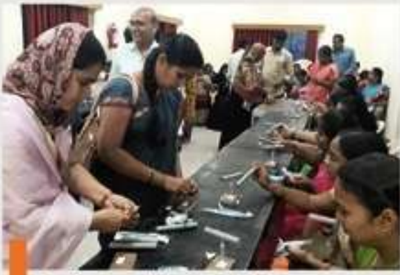
Teachers workshop at DSC G