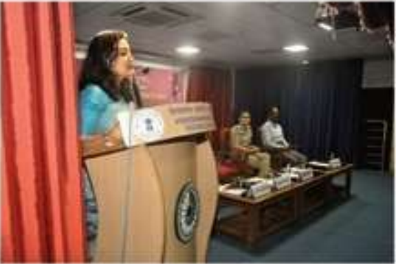
International Womens Day at VITM