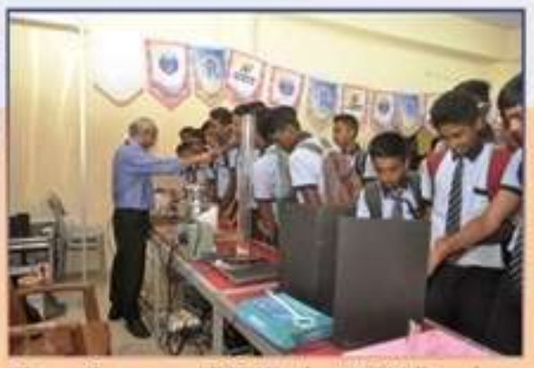
Vigyan Samagam ITER Week at VITM live plasma demonstration & models of plasma applications