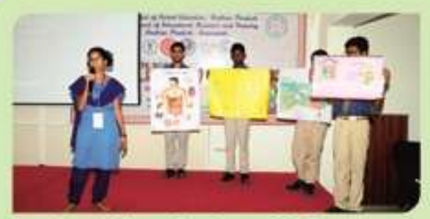
State Level Science Seminar at RSC T