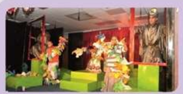
Southern India Science Drama Festival at VITM