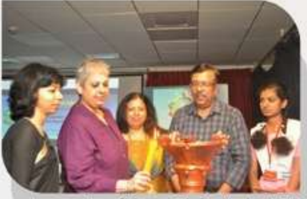
Inauguration of Science Film Festival at VITM