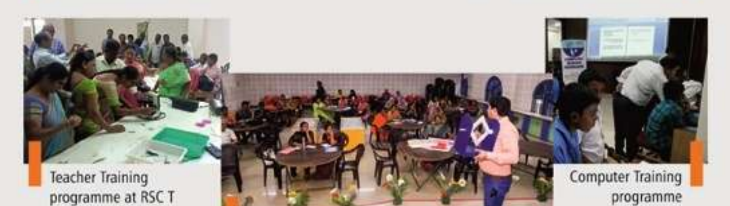
Teacher Training programme at RSC & P C