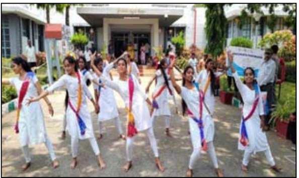
Flash Mob on Swachha Bharat Abhiyan at RSC, T during Swachhata Pakhwada

Students performing the Drama during District level Science Drama on 'Science and Technology for the benefits of mankind' at DSC G