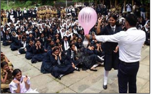
SDL at Nadakkavu Girls HSS, Kozhikode organised by RSCP C