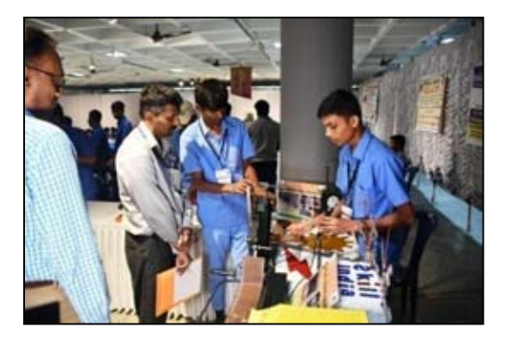
Engineering Fair participants interacting with visitors

Southern India Science Fair – Inauguration Exhibition – participants interacting with visitors