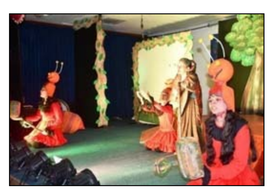
SISDF 2023 First Best Drama Sirdhanyave Saridhanya - Karnataka