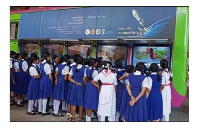
MSE organised at St. Therasus HSS Kannur by RSCP C,