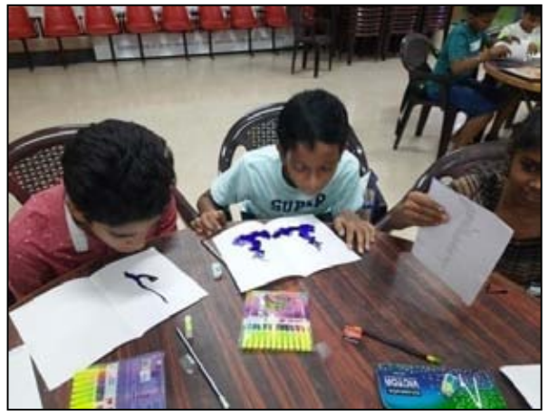
Vijnana Kauthukam Creativity Workshop at RSCP C