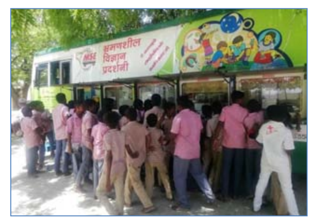
MSEorganised by DSC T