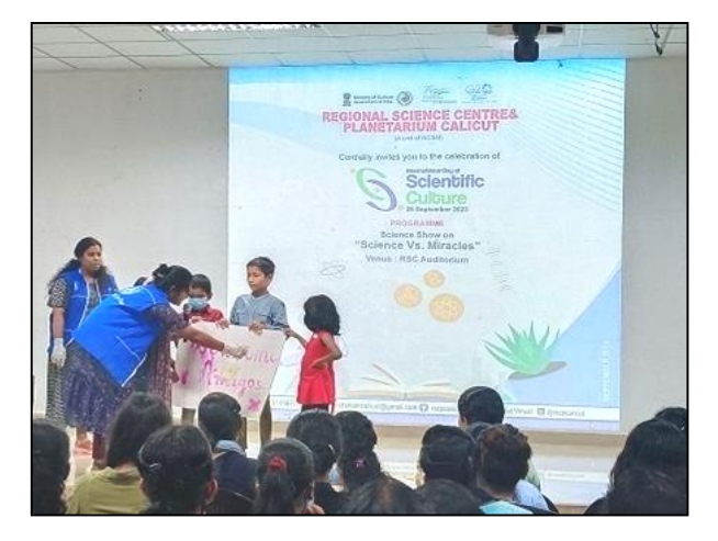
Science Vs Miracles show during International Day of Scientific Culture on 28<sup>th</sup> September 2023 at RSCP C

Elocution Contest on the topic 'India: Vision 2047' at RSC, T on 17^{th} September 2023 during Engineer's Day celebration