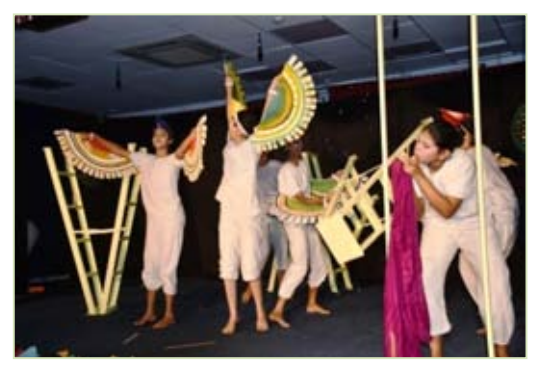
SISDF 2023 Second Best Drama Lets Fly -Kerala