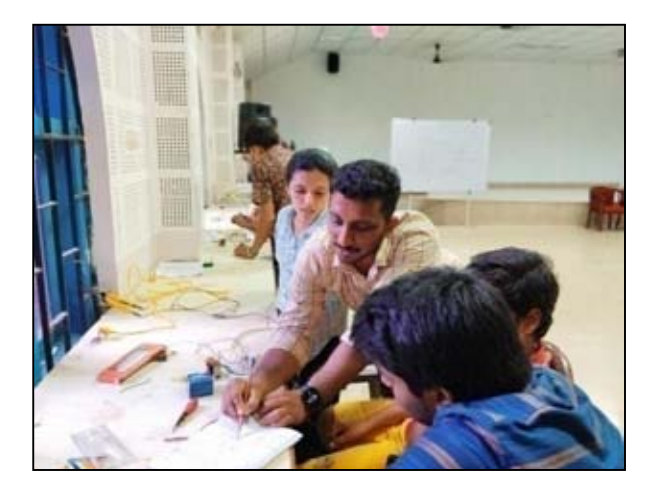
Electronics Creativity Workshop at RSCP C