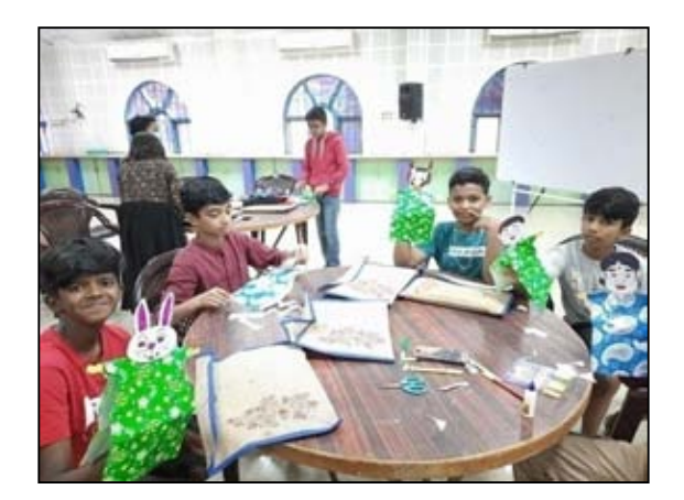
Vijnana Kauthukam Creativity Workshop