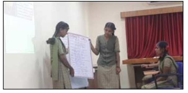
District level Science Seminar organised at DSC G