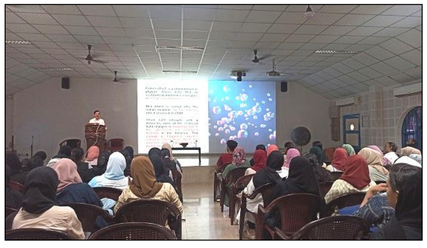
Lecture on "Indigenous Technologies for Viksit Bharat" on Science Day

Lecture on Innovative Technologies for Science Museums on National Technology Day