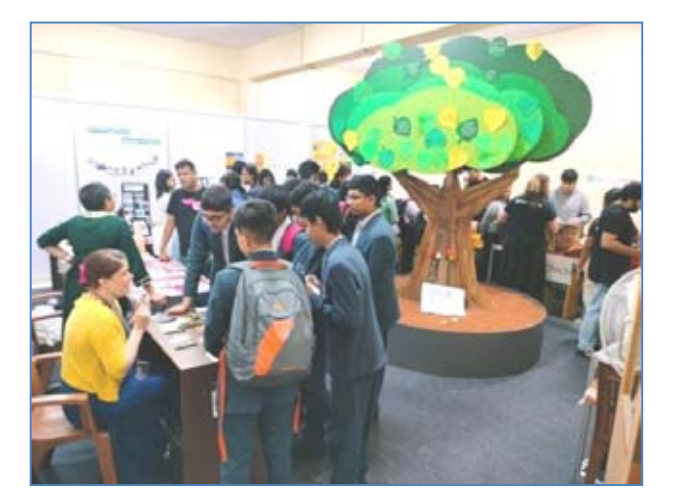
Exhibition on Heart for Earth organised during 57<sup>th</sup> Anniversary of the VITM