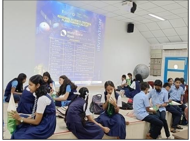
Water Rocket Modeling Workshop during World Space Week in October 2023 at RSCP C