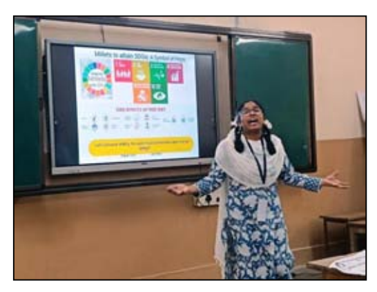
Participant in Pondicherry State level Science Seminar

The Museum extended catalytic support to the Education Departments of Southern States in organising their State level Seminars on the theme 'Millets – a Super food or a diet fad'. Pondicherry State level Science Seminar 'was held on 11<sup>th</sup> September 2023, Telangana State level Science Seminar was held on 19<sup>th</sup> September 2023. Andhra Pradesh State level Science Seminar was held on 25<sup>th</sup> September 2023. Kerala State level Science Seminar was held on 26<sup>th</sup> September 2023. Karnataka State level Science Seminar was held on 26<sup>th</sup> September 2023.