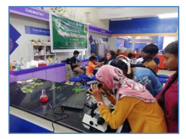
Vacation Hobby Centre in Bioscience at DSC T