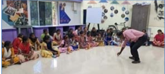
Science show during the Underprivileged Children visit to DSC T