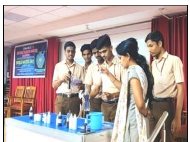
Demonstration on 'Water Quality check' during the observation of World Water Day at DSCG