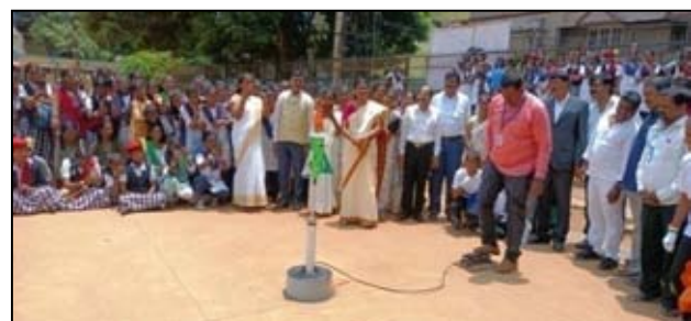
Mobile Science Exhibition at BBMP Composite High School & Pre University College at Mathikere, Bengaluru