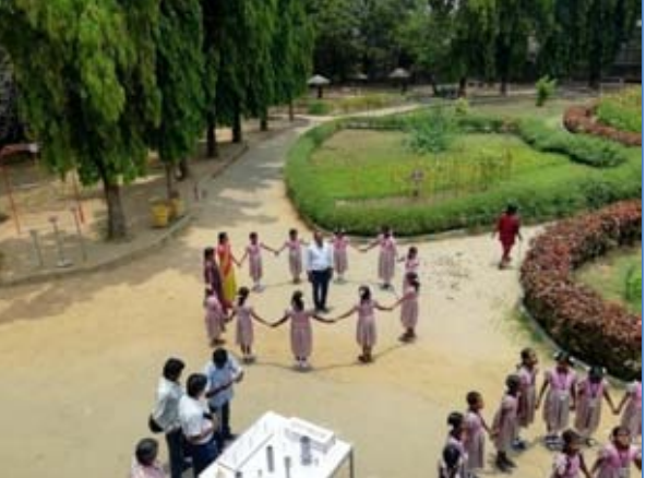
Live demo held during Zero Shadow Day on 12^{\rm th} {\rm April}\ 2024 at DSC T