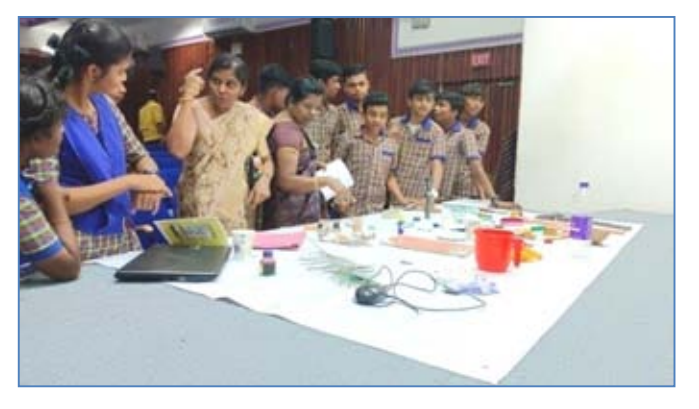
'Memory' contest for Hearing Impaired students during Children's Day at DSC G