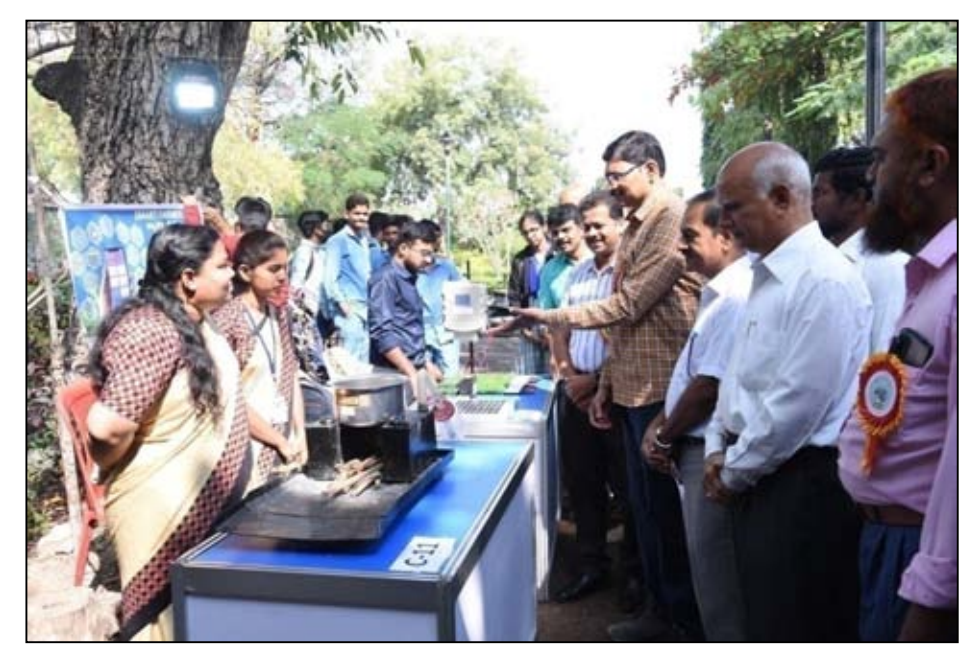
Innovation fair exhibition stall at DSC G.