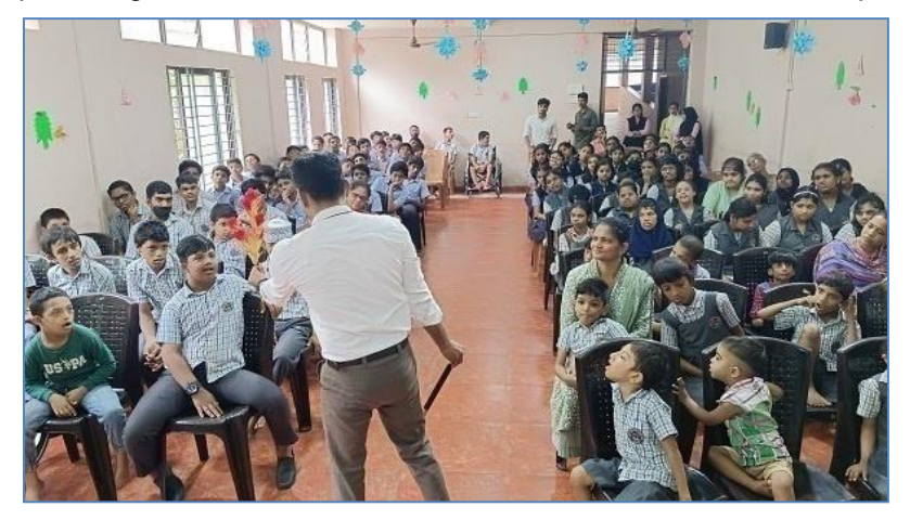
Outreach Activity for Differently Abled Children

2 Outreach science activity programmes were organised for differently abled students by the Centre at Ashakiran school for Differently Abled Children and Karuna Speech & Hearing School on 10<sup>th</sup>July 2023 and July 12,2023. Liquid nitrogen show was conducted for the children. 1040 students participated.