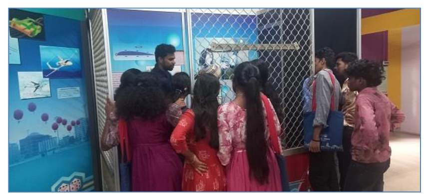
Guided tour for Underprivileged Children

Underprivileged children visited the Centre on in November 2023. The Science Centre organized Guided tour, 3D and Planetarium shows & Open house quiz for the Children. Science Kits were also distributed.