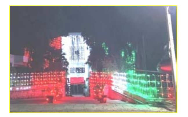
View of DSCG with tricolor illumination during the celebration of Azadi Ka Amrit Mahotsav

As a part of Celebration of AzadiKa Amrit Mahotsav, a singing contest was organised for the staff of DSCG on 15<sup>th</sup>August, 2023. Tiranga Selfie points were provided as additional facility to the visitors in the science Centre on 14th &15<sup>th</sup> August, 2023. The tri colour illumination was projected with LED lighting system on the main building of the District Science Centre including entrance. 65 students, staff and general public participated.