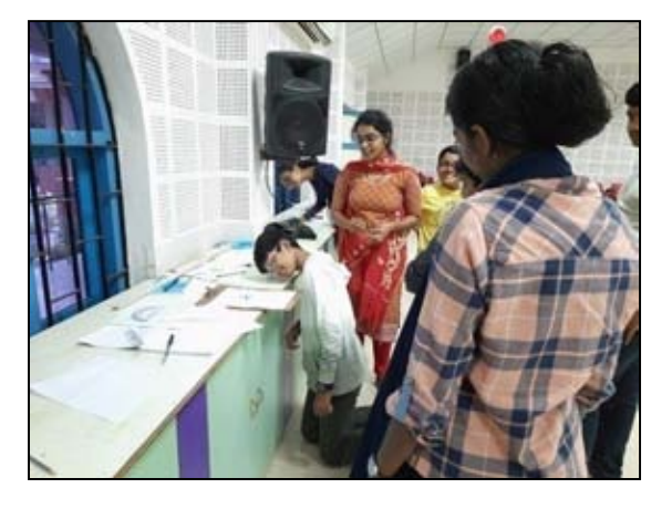
'Art of physics' Creativity Workshop

Summer vacation creativity workshops were organized at the Centre. Creativity workshop "The Joy of Learning Science "was conducted from 17<sup>th</sup> -23<sup>rd</sup> April 2023.Creativity workshop "The Art of Physics" was conducted for high school students from 24<sup>th</sup> to 28<sup>th</sup> April 2023. Creativity workshop "STEM projects" and Creativity workshop "Vijnana Kauthukam" were conducted for upper primary school students was conducted from 1<sup>st</sup> to 6<sup>th</sup> May 2023. "Electronics" Creativity workshop was conducted form 8<sup>th</sup> to 13<sup>th</sup> May 2023 for high school students. "Chemistry" Creativity workshop was conducted for high school students from 8<sup>th</sup> to 23<sup>rd</sup> May 2023.