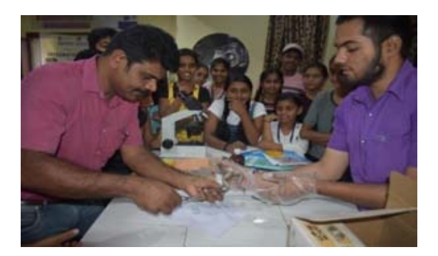
Vacation science camp – Biology held at DSC G

Teachers' training programme was conducted on 8<sup>th</sup> February 2024. 12 curriculum based science models were developed during the Science model making workshop by the trainee teachers of Godutai College of Education, Kalaburagi. 35 trainee teachers attended the programme