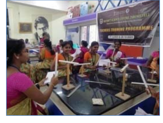
Teachers Training Workshop Phase -2 held at DSC T

Vacation Hobby Course on 'Electronics' was organised for School Students at DSC-T from 1<sup>st</sup> to 6<sup>th</sup> May 2023. 27 students participated.Vacation Hobby Courses on 'STEM' was organised for School Students at DSC-T from 8<sup>th</sup> to 13<sup>th</sup>May 2023. 29 students participated.Vacation Hobby Courses on 'Bioscience' was organised for School Students at DSC-T from 8<sup>th</sup> to 13<sup>th</sup> May 2023. 30 students participated.Vacation Hobby Courses on 'Astronomy' was organised for School Students at DSC-T from 8<sup>th</sup> to 13<sup>th</sup> May 2023. 34 students participated.