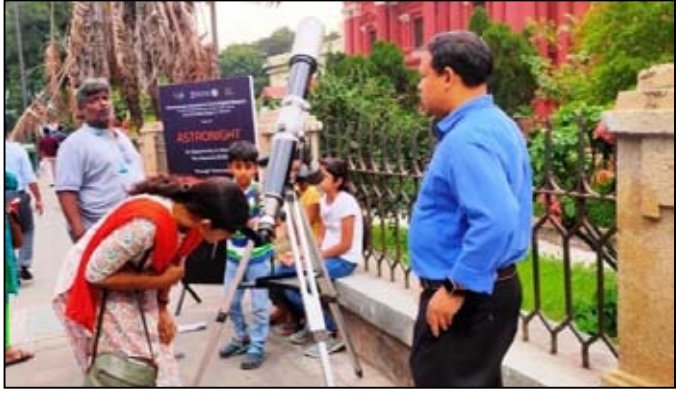
Special Sky Observation as part of Astronight Programme by VITM