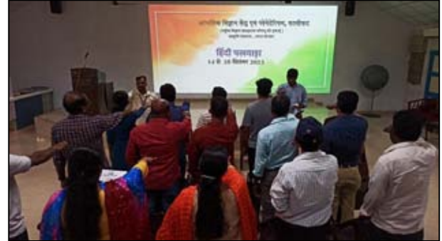
Staff members taking pledge on Hindi Diwas

Yoga demonstration during International Yoga Day