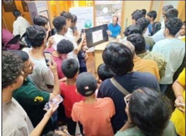
Science Show on Science is Fun at VITM