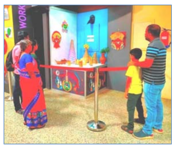
Exhibition on Waste to Art organised at VITM