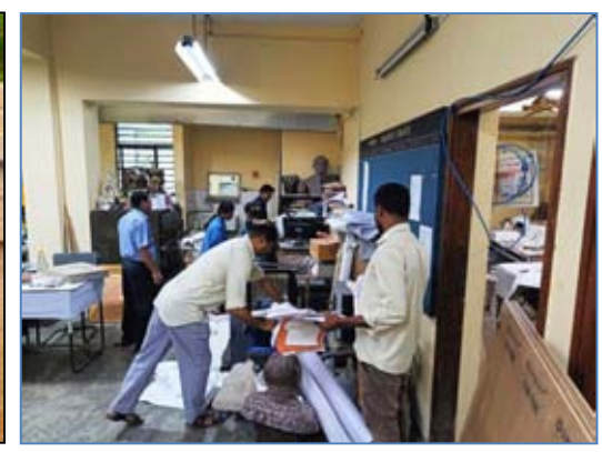
Swatchhata Drive Programe ('Shramdan') at VITM