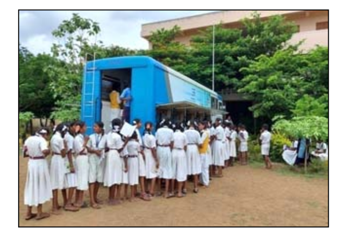
MSE at Govt High School, Indi taluk, Vijayapura District