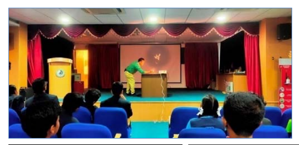
SDL on Electricity & Magnetism at VITM